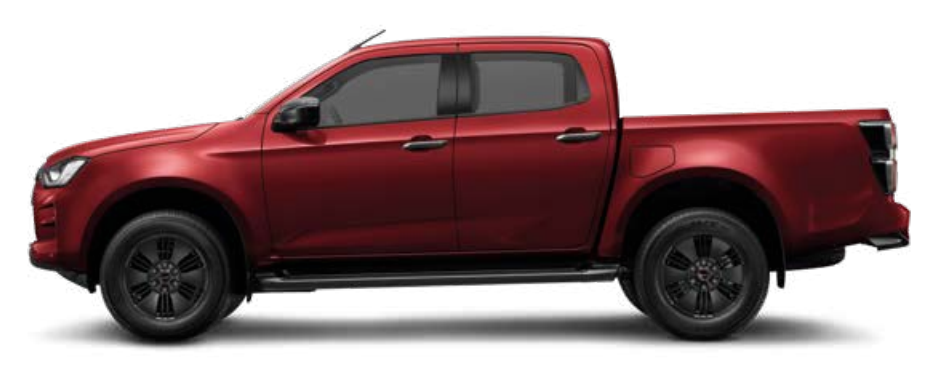
SPINEL RED MICA