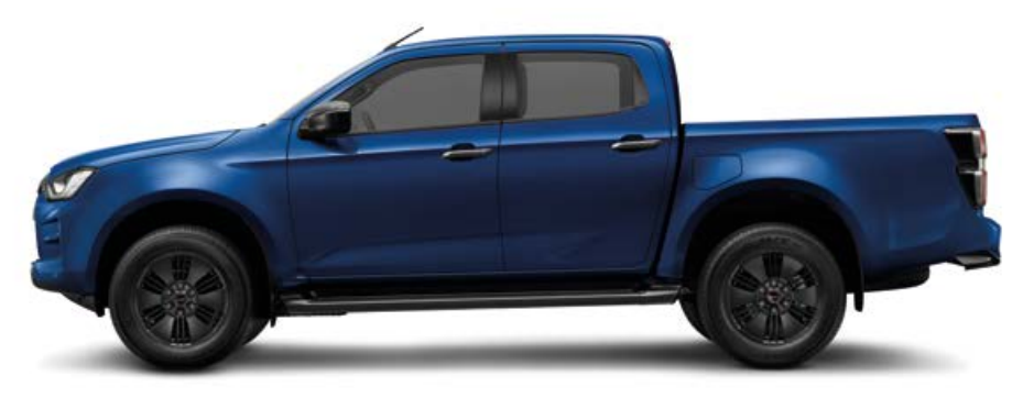
SAPPHIRE BLUE MICA