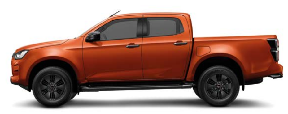
VALENCIA ORANGE METALLIC