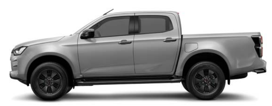
MERCURY SILVER METALLIC