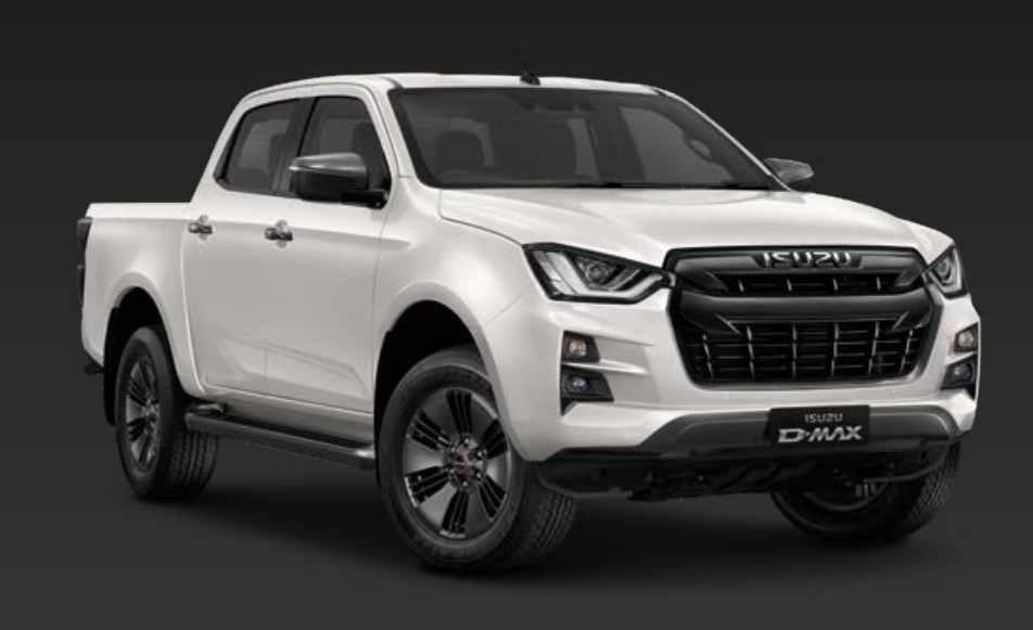
PEARL WHITE PEARLESCENT